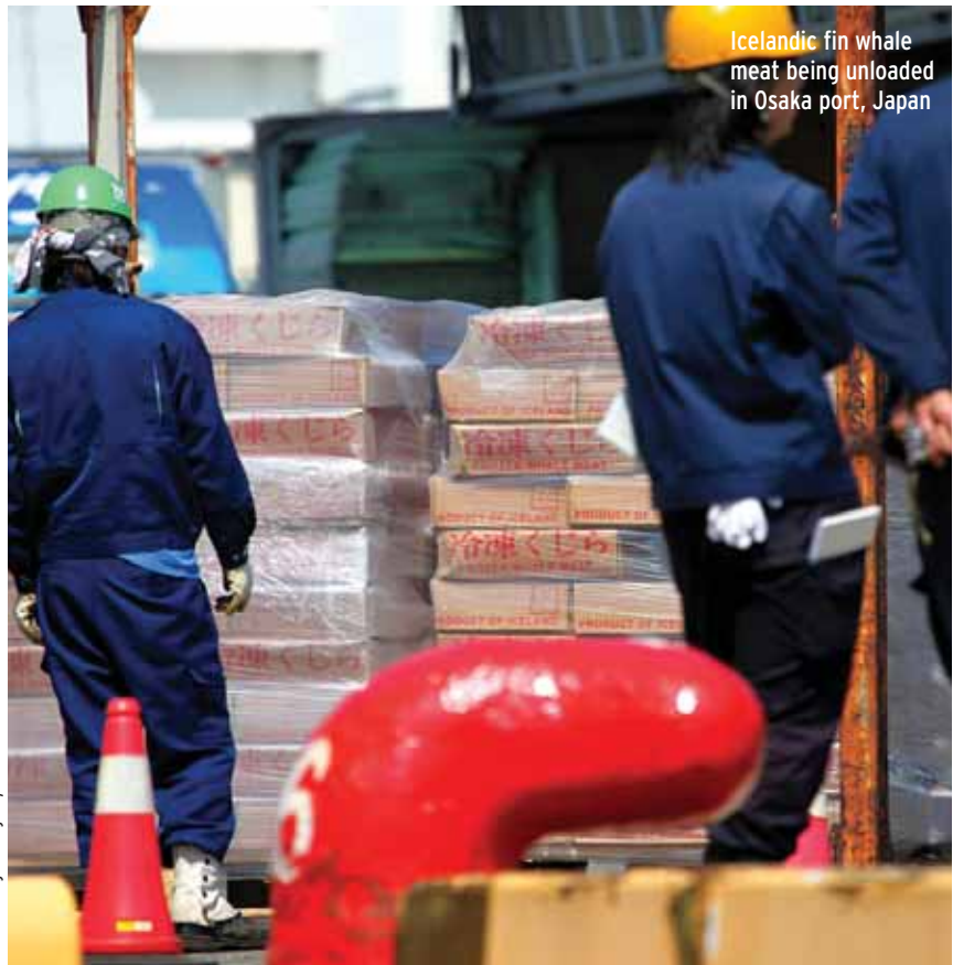
Icelandic fin whale meat being unloaded in Osaka port, Japan