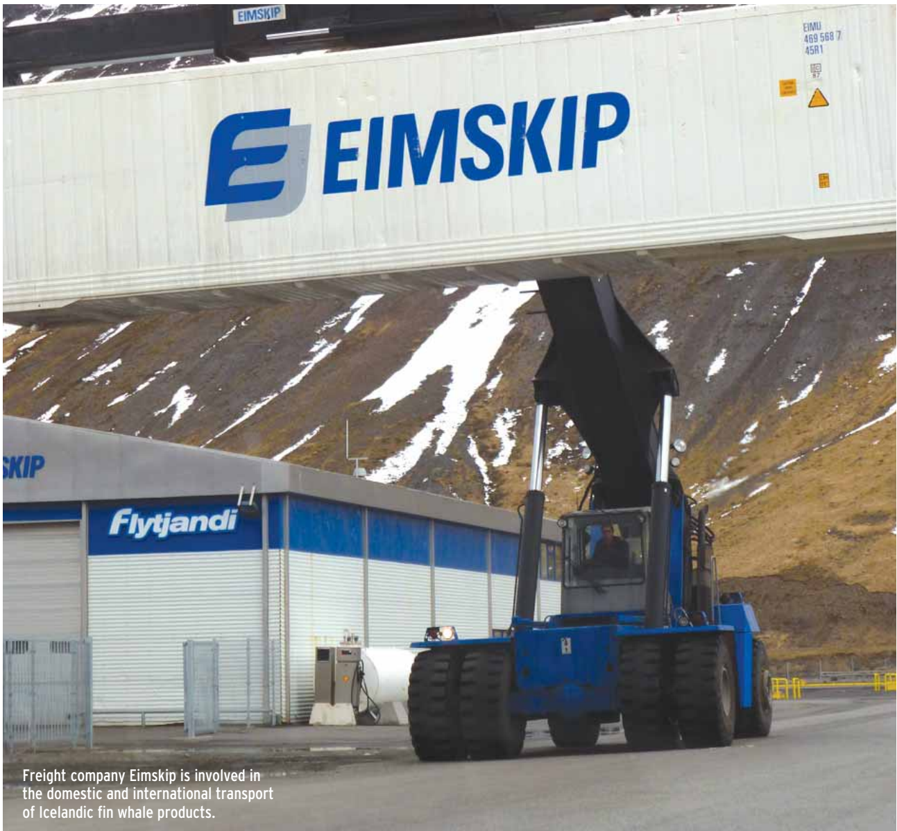
Freight company Eimskip is involved in the domestic and international transport of Icelandic fin whale products.