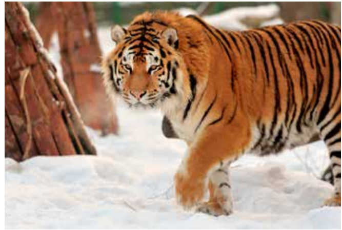
The world's last remaining 400 Siberian tigers live in the forests of the Russian Far East, which are being destroyed by organized criminal networks.

Flooring manufacturers across northeastern China, including Xingjia, told undercover EIA investigators that they regularly mix together oak from Russia, China, the United States, and the European Union. Nearly every manufacturer interviewed reported that they declare "country of harvest" to be whichever country their U.S. buyer finds most desirable — a clear violation of the requirement for buyers to accurately report country of harvest on the Lacey Act declaration form accompanying every shipment. In the plea agreement, Lumber Liquidators admitted to the felony charge of knowingly declaring false country of harvest for their imports of Mongolian oak — a species only found in northeast Asia — which the company declared as harvested in Germany. According to the court file "USA versus LL", the company was aware of this false declaration, given that prior to the shipment an employee identified and communicated to the company's Quality Assurance department, their Shanghai office, and their legal department that Mongolian oak does not grow in