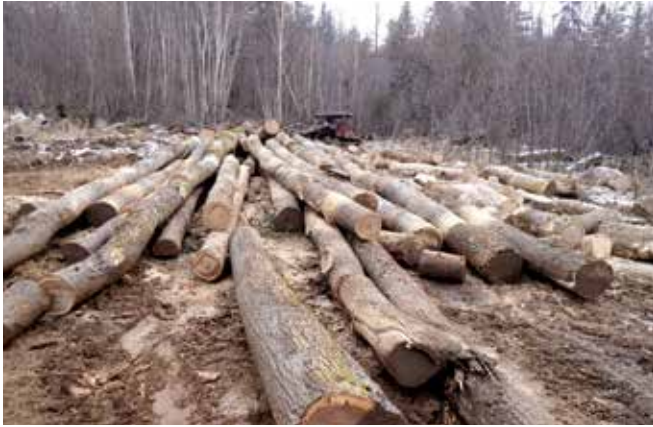
Illegally cut ash logs on the territory of Xingjia supplier Beryozoviy LLC.