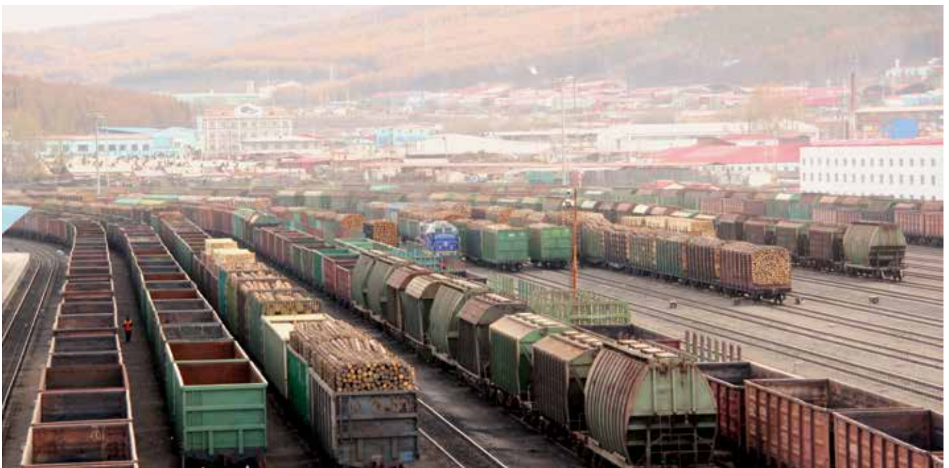
Chinese border town of Suifenhe, port of entry for 96% of the RFE's valuable hardwood exports.