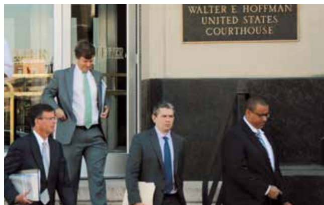
On October 22, 2015, Lumber Liquidators' pleads guilty to five counts related to illegal logging in federal court.

"The defendant will plead guilty because the defendant is in fact guilty of the charged offenses."