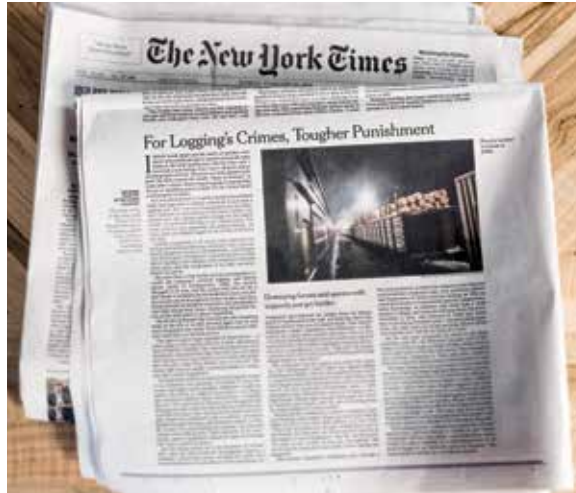
Lumber Liquidators' guilty plea profiled in The New York Times, February 2016.

The DOJ's enforcement and Lumber Liquidators' guilty plea have sent a strong signal that U.S. wood products' importers are increasingly being held accountable for conducting proper due care. This case shows that companies can no longer feign ignorance of the origins of the timber they buy from Chinese and other suppliers. U.S. importers of wood products sourced from China and possibly containing high-risk timber, in particular wood flooring, plywood, and furniture, should expect increased scrutiny from the U.S. government.