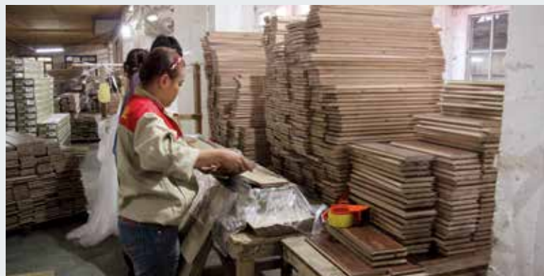
Workers packaging Lumber Liquidator's flooring at Xingjia Dalian factory.

EIA obtained eight samples of solid oak hardwood flooring from a batch of flooring that investigators observed being prepared by workers in Xingjia's Dalian factory for a shipment to Lumber Liquidators. EIA sent these eight samples for testing of stable isotopes — a decades-old technology that has recently been applied to wood products testing. Test results indicated with a 97 percent or greater degree of certainty that seven out of the eight samples came from trees grown in the RFE.